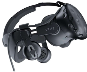
VIVE Deluxe Audio Strap